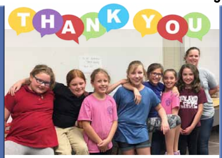
Thank you for packing our Food 2 Kids Bag. You are so appreciated!

FBC's Starting Point training course is available on the FBC website at www.fbc-midland.org/starting-point