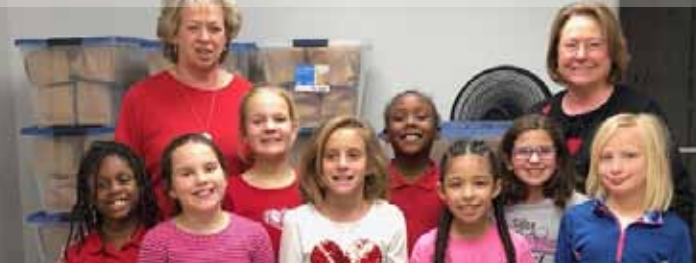
Thank you to the 3rd grade GA's for packing our Food2Kids bags & blessing so many in need!