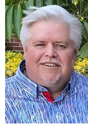
Jeff Wash, Minister of Media & Communications

THIS SUNDAY, SEPTEMBER 9, 4:30 P.M. FELLOWSHIP HALL 1 & 2