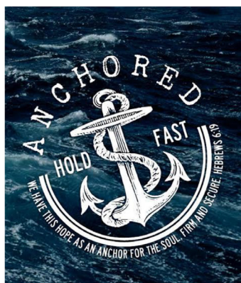
CAMP COPASS SUMMER CAMPS 2017